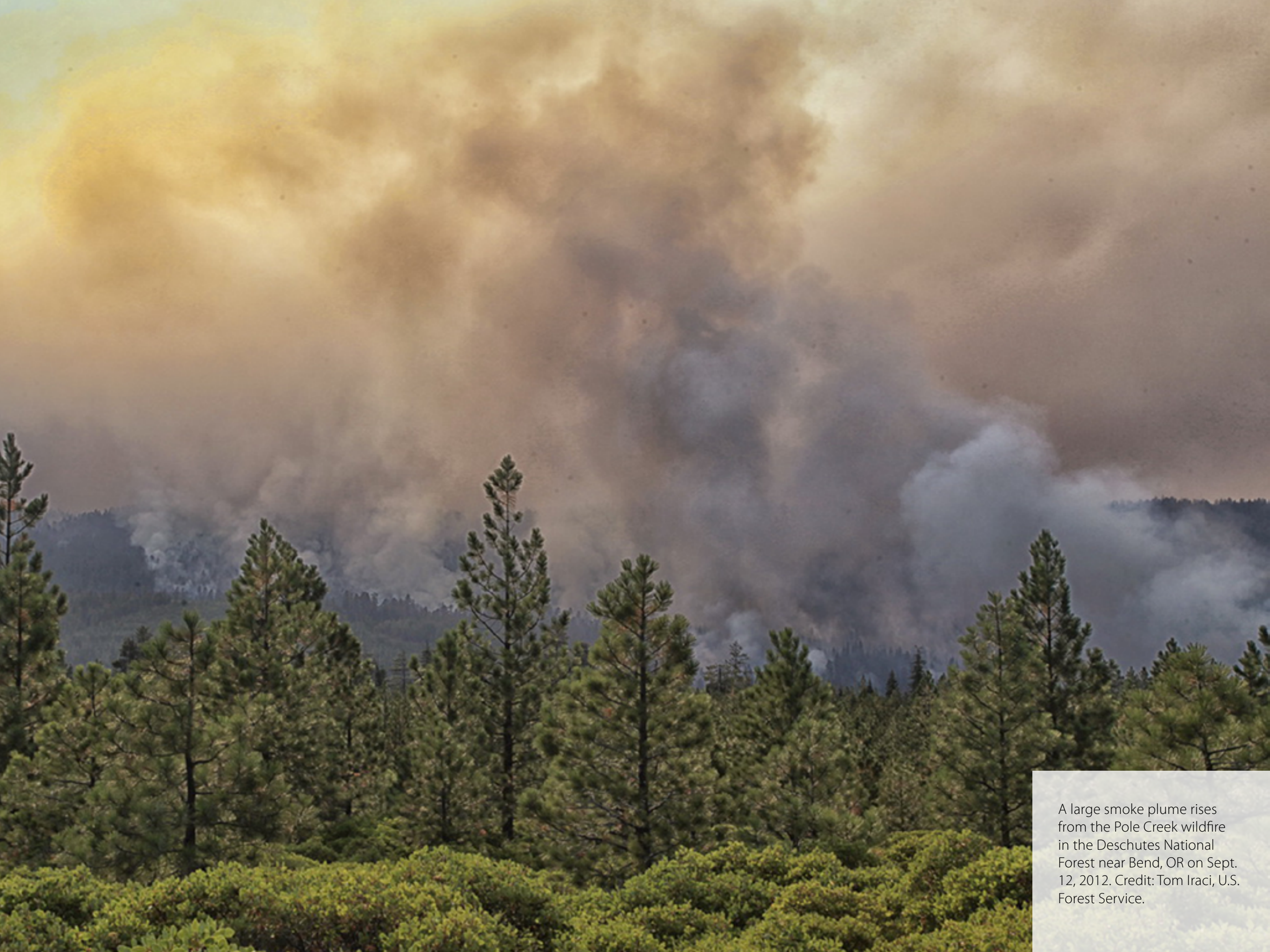
A large smoke plume rises from the Pole Creek wildfire in the Deschutes National Forest near Bend, OR on Sept. 12, 2012.