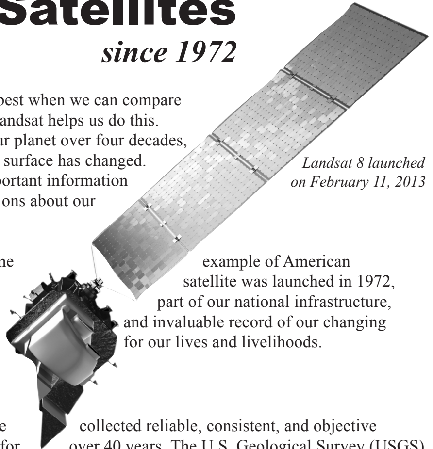
Landsat 8 launched on February 11, 2013

A series of seven Landsat satellites have observations of the global land surface for maintains an archive of images from all to the public allowing anyone to search, browse and download over 6 million images online for free.